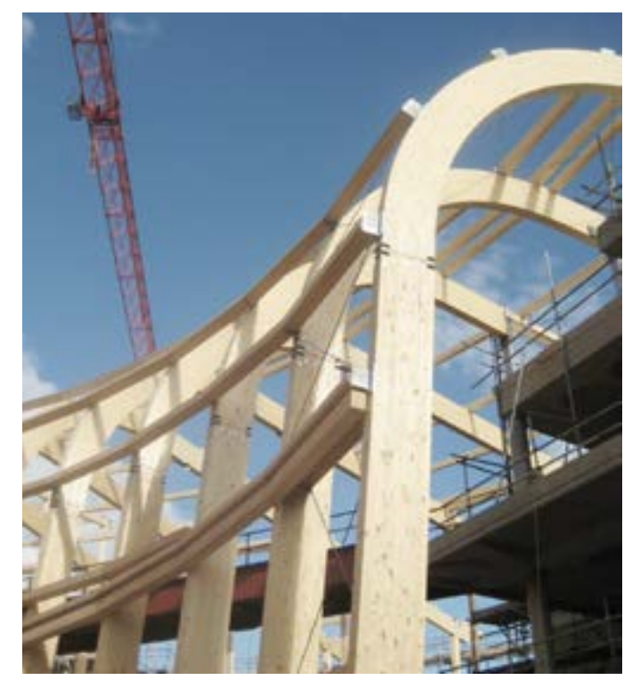
University of Reading, arched façade supports General butt joint on building site