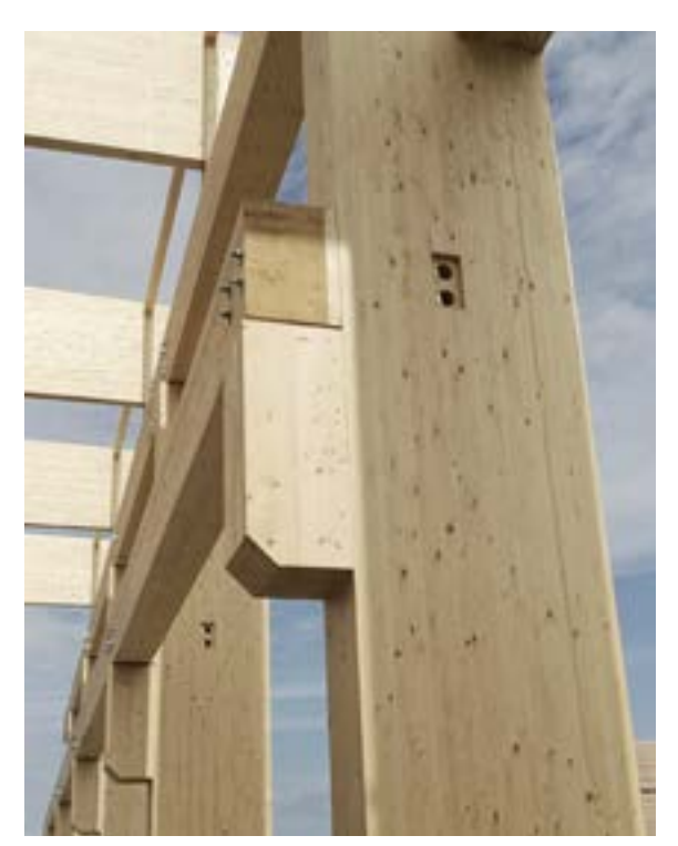
Bearing bracket in GLT design. Block-bonded craneway: 400 x 690 mm. Heavy-duty crane with loads up to 16 tonnes.