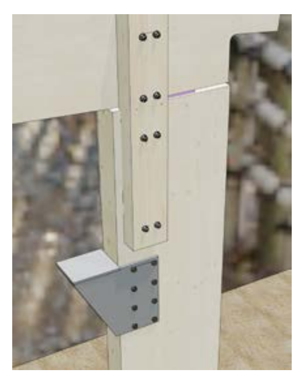
Wooden stanchion with steel craneway bracket