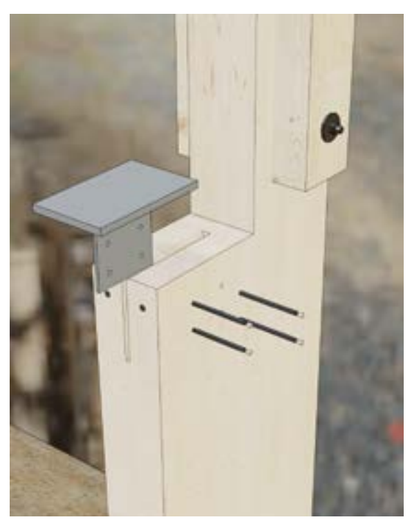
{\it Craneway \, stanchion \, with \, support \, steel \, part \, for \, building \, site \, crane \, track.}

In the case of fire protection requirements, the steel parts are provided with a fireproof coating and the fasteners protected with cover panels. Block-bonded cross-sections also allow comparatively high overhead clearances to be achieved with a compact construction method.