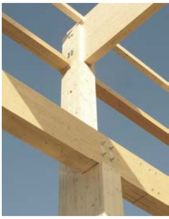
Wooden support with notch for GLT craneway. Block-bonded cross-section: 480 \times 990 mm. Heavy-duty crane with loads up to 16 tonnes.