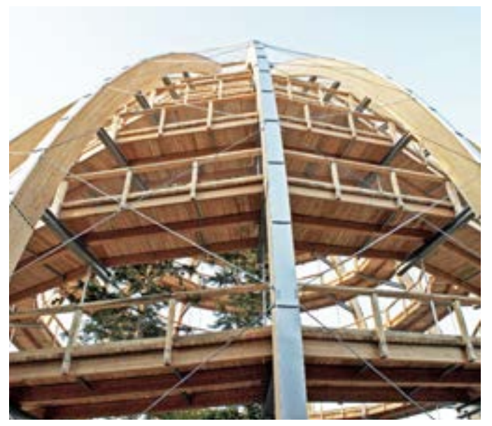
Neuschönau tree tower Curved stanchions with walkway beams