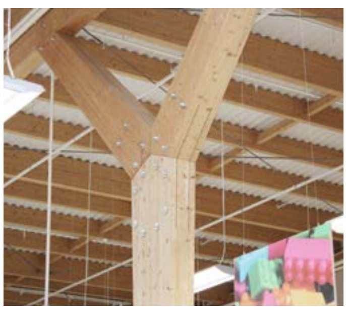
Tesco Banbridge Y-stanchion with slotted plate/rod dowel connection