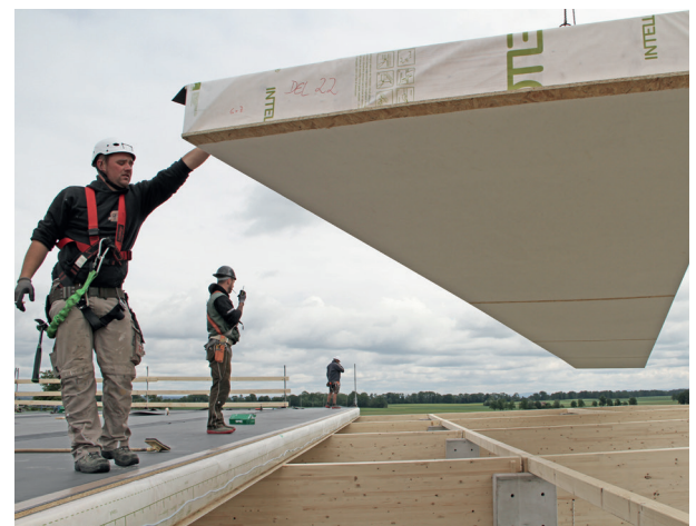
High-speed installation thanks to large-format elements