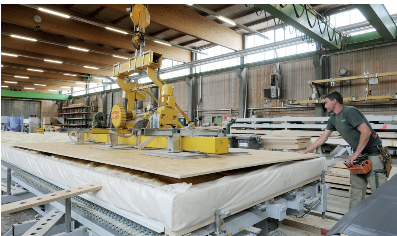
Prefabrication at the factory, including all rooflights and gullies