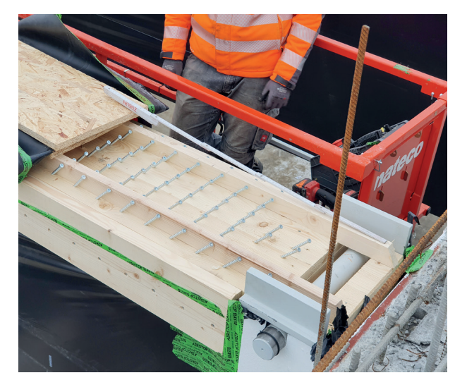
Walk-on, weatherproof covering of the compound screws possible