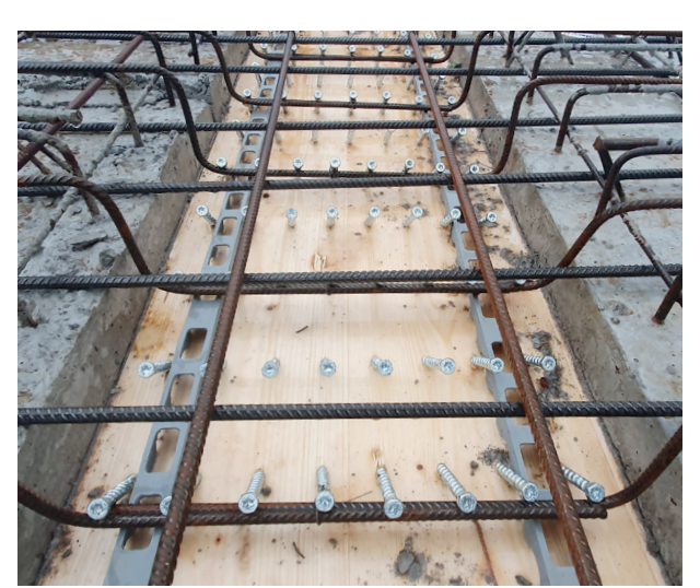
Interface between concrete reinforcement and shear