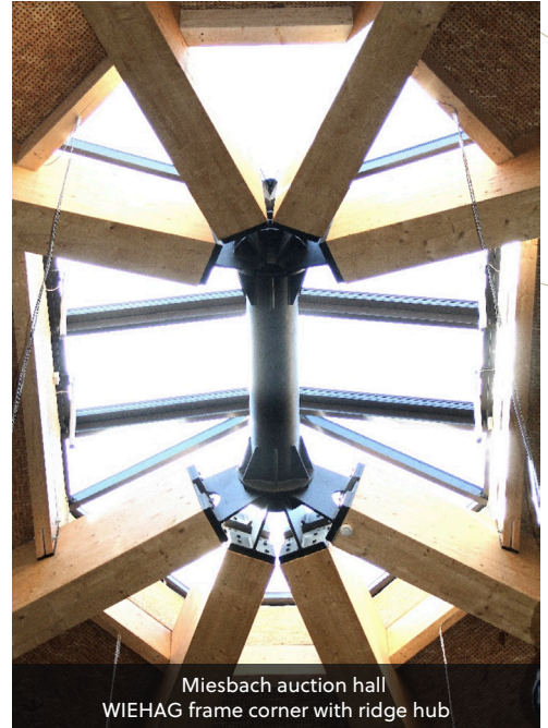
Miesbach auction hall WIEHAG frame corner with ridge hub