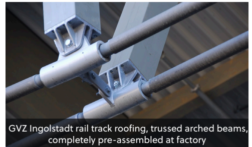
GVZ Ingolstadt rail track roofing, trussed arched beams, completely pre-assembled at factory