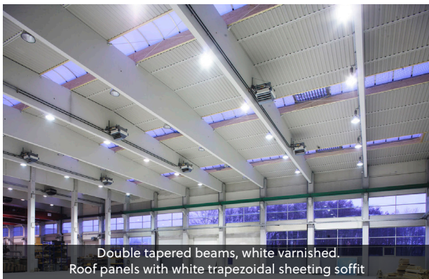
Double tapered beams, white varnished. Roof panels with white trapezoidal sheeting soffit