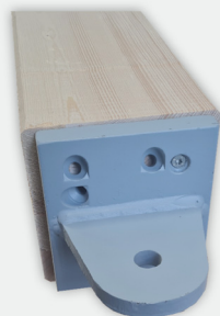
RAL 7001 silver grey (standard)