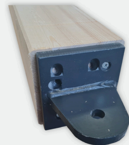
RAL 7016 anthracite grey

Other colours available on request or supplied on site.