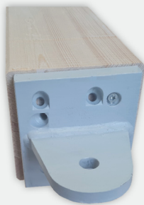
RAL 7035 light grey