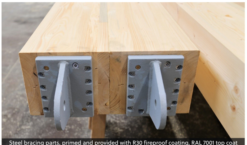
Steel bracing parts, primed and provided with R30 fireproof coating, RAL 7001 top coat