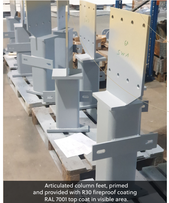
Articulated column feet, primed and provided with R30 fireproof coating RAL 7001 top coat in visible area.

Up to C3 galvanised; C4 and above on request (duplex coating, stainless steel)