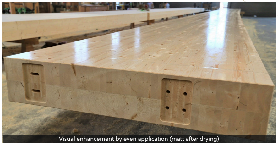
Visual enhancement by even application (matt after drying)