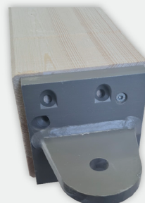
RAL 7006 beige grey