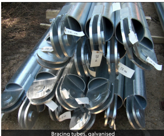
Bracing tubes, galvanised

Other colours available on request or supplied on site.