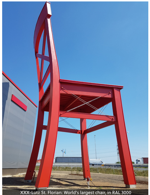
XXX-Lutz St. Florian: World's largest chair, in RAL 3000